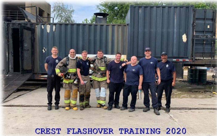
CREST FLASHOVER TRAINING 2020

and continued to train personnel through virtual and traditional in person training environments. Through grant funding, the department was able to receive on-site, live, flashover training from Oakland Community College's mobile training staff and their state-of-the-art flashover trailer.